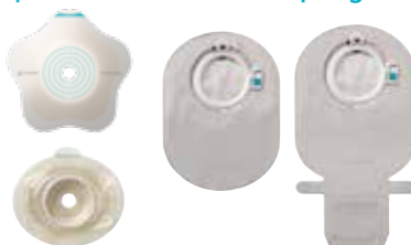
Barrier and pouch are separate (two plastic pieces snap together)