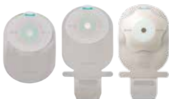
Barrier and pouch combined