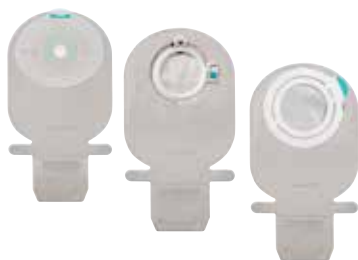
Drainable pouch with integrated closure