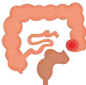
Sigmoid End Colostomy located within the sigmoid colon.

Just like your gums sometimes bleed when you brush your teeth, your stoma may also bleed slightly. However, if your stool is bloody, or you have constant bleeding, you should contact your doctor. Since the colostomy has no sphincter muscles, you will not be able to control your bowel movement (when stool comes out). You will need to wear a pouch to collect the stool.