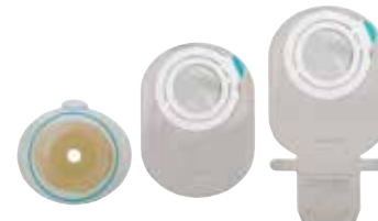
Barrier and pouch are separate (flexible coupling sticks together)