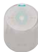
Closed pouch for a low-profile and greater convenience