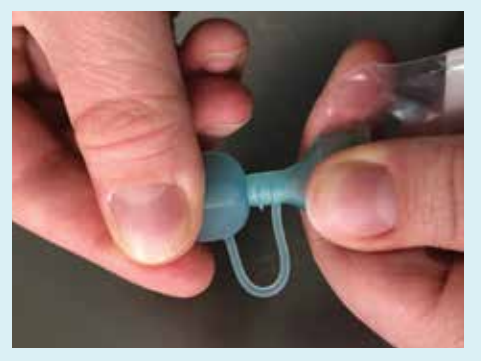
Close the outlet on the pouch.